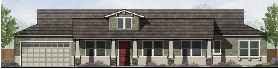
TRADITIONAL FRONT ELEVATION

Plan 1 – Single-story, approximately 2,770 square feet 4 bedrooms, 3-1/2 baths, 2-car garage Lot 2 and Lot 11