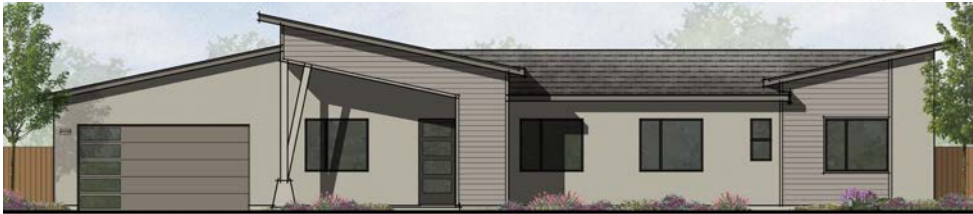
CONTEMPORARY FRONT ELEVATION

A rare find in new home construction, this single-story home is comfort and luxury rolled into one. This spacious floorplan delivers a grand owner's suite, a private secondary suite and two secondary bedrooms that share a Jack and Jill bath. The kitchen, nook and family room flow together to provide a comfortable setting for a quiet night at home, or a boisterous gathering of family and friends. For those more formal occasions, a beautiful dining room resides steps from the kitchen, through the butler's pantry. Adjacent to the entry is flexible space that could serve as a parlor, a media room, a home office, even an exercise room. Your vision!